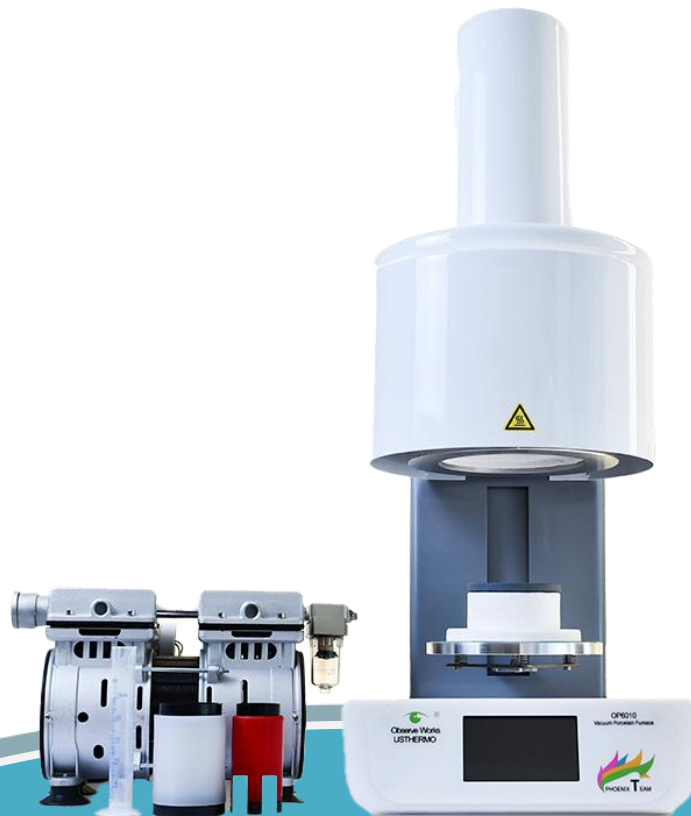
Dental press furnace